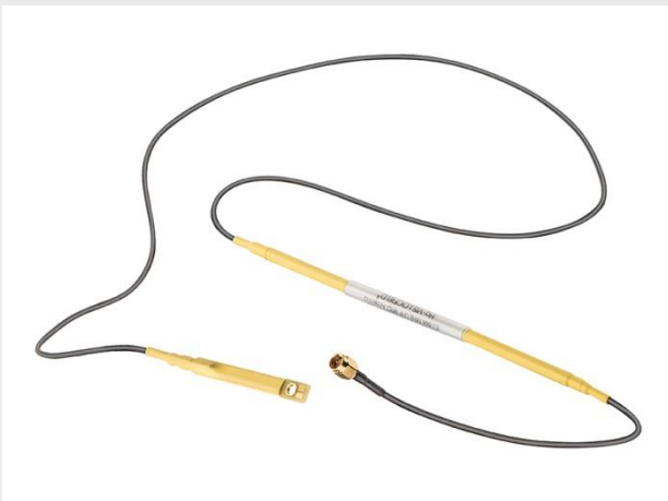
Ha-VIS LOCFIELD® UHF RFID antenna – a flexible coax cable

Wouldn't it be great if you could design your RFID reading zone in almost any arbitrary shape you like and need in your current project? The Ha-VIS LOCFIELD® antenna brings you very close to this vision.